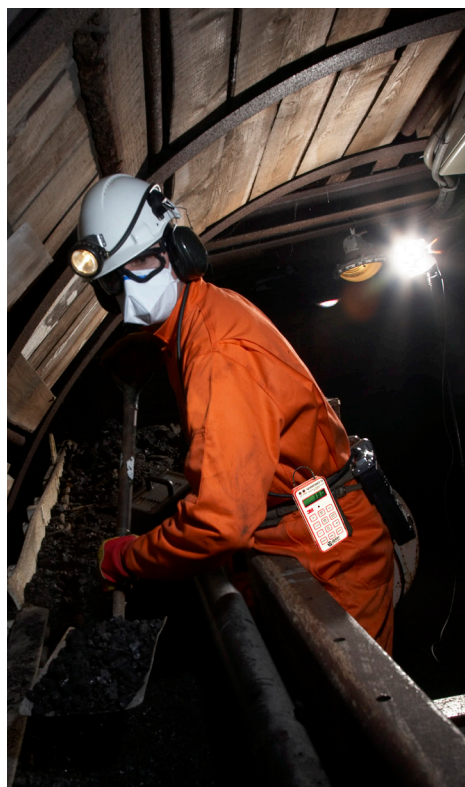
Mining and the QUESTemp II

not treated. In most cases, heat rashes will disappear when the affected individual returns to a cool environment.